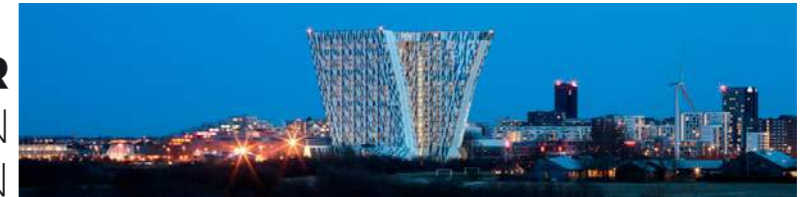
Bella Center Copenhagen - Center Boulevard 5 - DK - 2300 Copenhagen